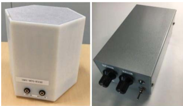
Figure 1: Sound source device of 15 - 40 HZ DMV stimulation.