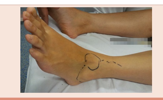
Figure 1: Distribution of pain sensation.

Occasionaly she complained of numbness within this area. Symptoms started nine months ago during the last trimester of her pregnancy. Her symptoms were often aggravated by physical activities especially with activities involving the left leg. She was diagnosed as "atypical left L5/Sl radiculopathy" at another university department. Examination showed no sensory loss and mild atrophy of left EDB.