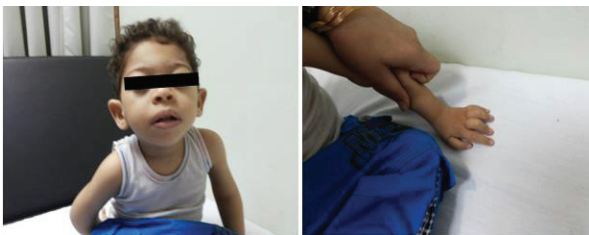
Figure 2: Younger brother presented with megalocornea, prominent ears, tower head (left panel); and clinodactyly of the 2nd and 3rd fingers (right panel).