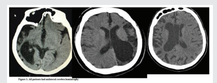
Figure 1: All patients had unilateral cerebra hemiatrophy.

patients had a known history of epilepsy. There were similar seizure symptoms in all 19 patients of another study [2], and a different study reported seizures in 17 of 26 patients [4]. Epileptic seizures with DDMS are more common in adolescence and are often resistant to treatment [12–14]. In our study, while one patient had epileptic seizures from birth, the starting ages for the other patients were 7, 8, 10, 12, and 13 years. The mean age of seizure onset was 7.1 years (range 0–13) years. In the literature, late-onset epilepsy cases have