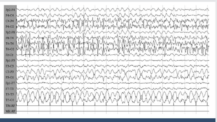
Figure 1.4: Symptomatic focal epilepsy of Sturge-Weber syndrome [46].